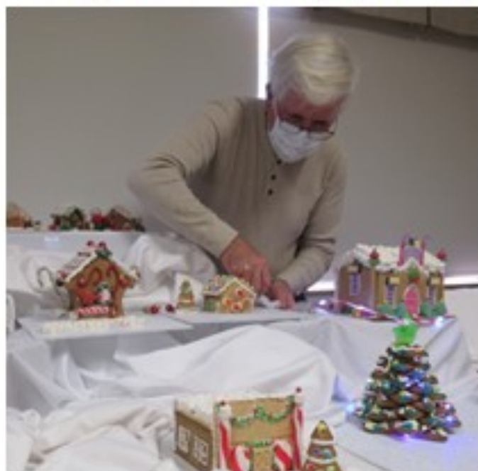
Members of the Greentree Garden Club setting up the village.

The Greentree Garden Club created a 16ft. Gingerbread holiday display that includes 19 houses, a church and Santa's Workshop. The village will be on display through the end of December.